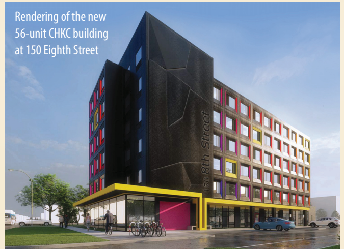
Rendering of the new 56-unit CHKC building at 150 Eighth Street