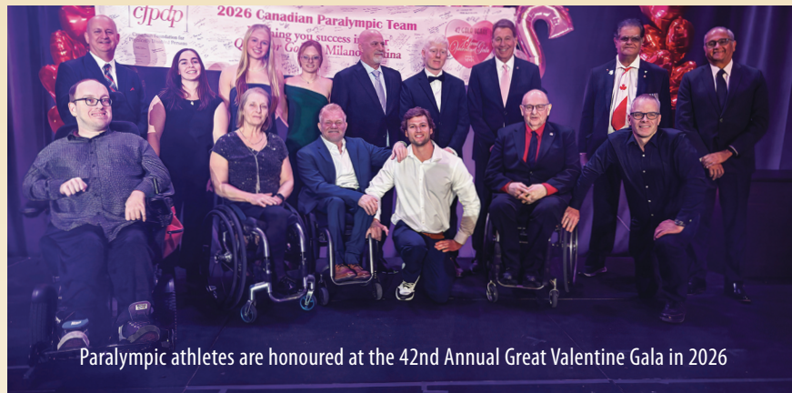
Paralympic athletes are honoured at the 42nd Annual Great Valentine Gala in 2026

WhyNot. Published twice a year, WhyNot Magazine promotes the disability community's issues and achievements.