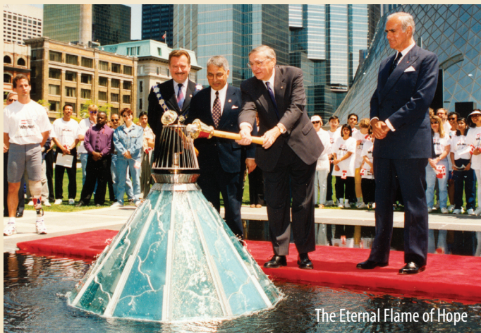
The Eternal Flame of Hope

The Eternal Flame of Hope: Ignited in 1996 by Governor General Roméo LeBlanc, the flame still burns in the public square of Toronto's Metro Hall as a permanent symbol of the disability community's dreams and triumphs.