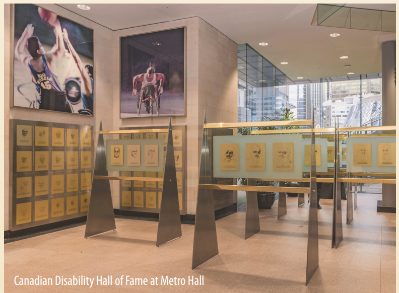
Canadian Disability Hall of Fame at Metro Hall

Over more than four decades, CFPDP has helped raise over $85 million for Canadians with disabilities and the support and vital services they require. Among many important initiatives, funds have been directed toward creating affordable, accessible housing for people who are deafblind; programming and skills-based training for people with disabilities; national public awareness projects like the WhyNot Marathon; and long-term, substantial support for our nation's Paralympic movement.