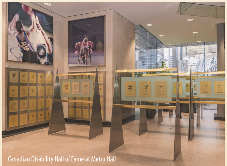
Canadian Disability Hall of Fame at Metro Hall

Canadian Disability Hall of Fame at our annual luncheon. Over more than four decades, CFPDP has helped raise over $85 million for Canadians with disabilities and the issues and vital services they require. This year's inductees will be announced in June 2026 following a meeting of the Selection Board, which is chaired by the Honourable David Crombie.