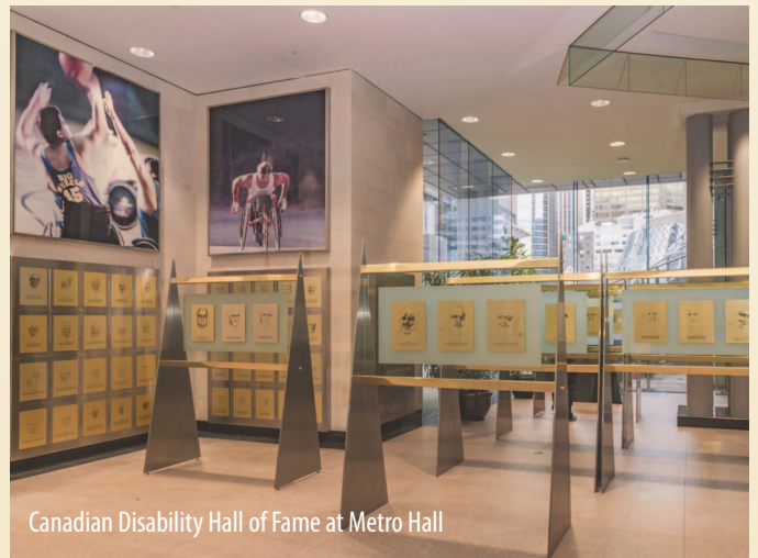
Canadian Disability Hall of Fame at Metro Hall

The Hall of Fame was officially opened on February 11, 1993 at Metro Hall in downtown Toronto. In almost four decades, CFPDP has raised