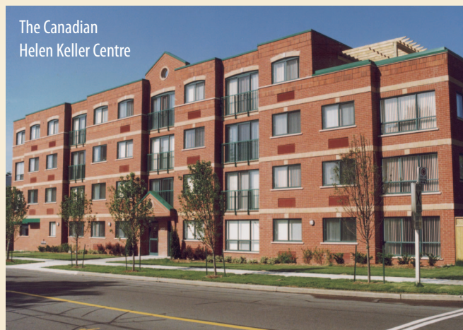
The Canadian Helen Keller Centre