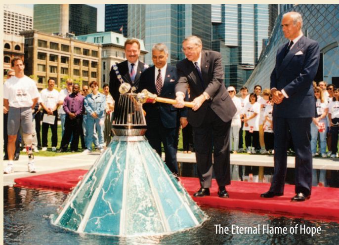
The Eternal Flame of Hope

The Eternal Flame of Hope: Ignited in 1996 by Governor General Roméo LeBlanc, the flame still burns on the public square of Toronto's Metro Hall as a permanent symbol of the disabled community's dreams and triumphs.