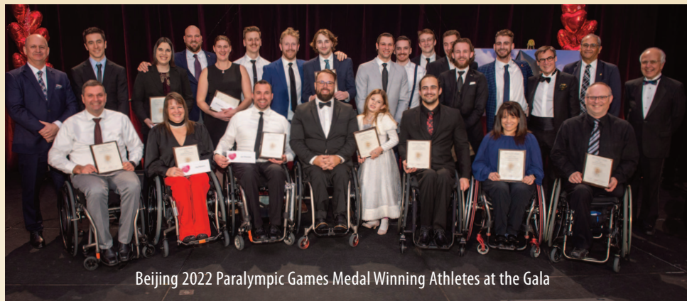
Beijing 2022 Paralympic Games Medal Winning Athletes at the Gala

Paralympic sport: For 40 years the CFPDP has been an active and significant sponsor of Paralympic athletes and the Canadian Paralympic Committee.