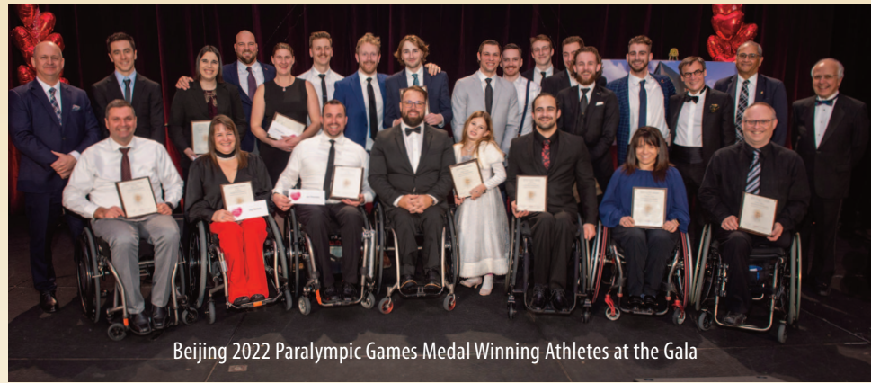
Beijing 2022 Paralympic Games Medal Winning Athletes at the Gala