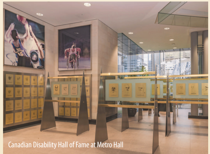
Canadian Disability Hall of Fame at Metro Hall

The Hall of Fame was officially opened on February 11, 1993 at Metro Hall in downtown Toronto. In almost four decades, CFPDP has raised