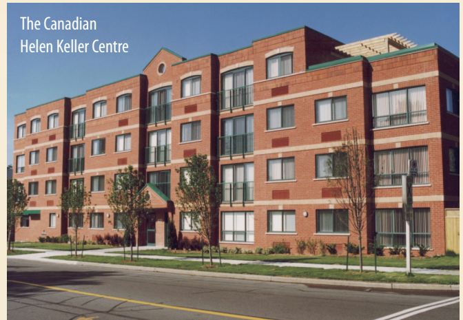
The Canadian Helen Keller Centre