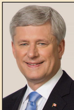
Rt. Hon. Stephen J. Harper