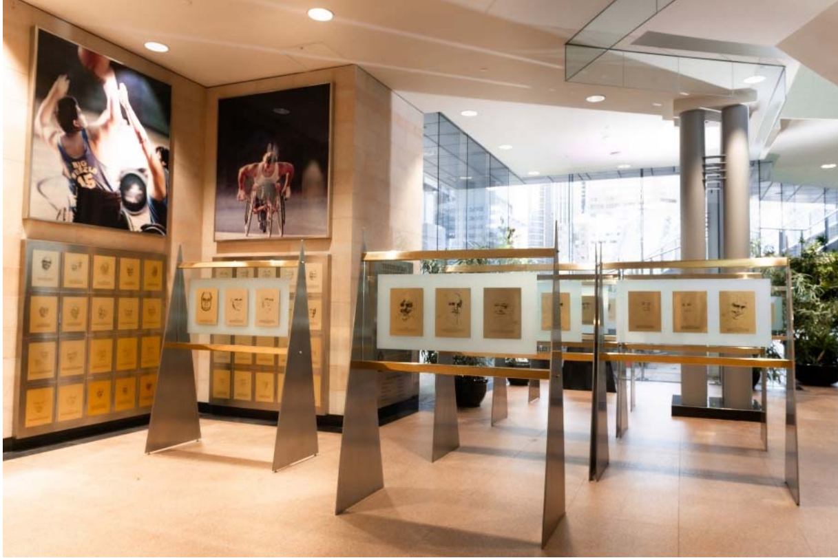
Canadian Disability Hall of Fame at Metro Hall